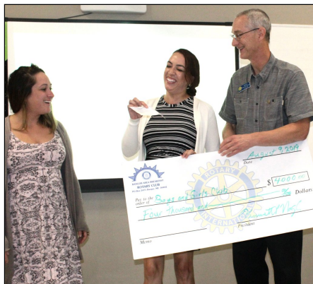
She got the REAL check!