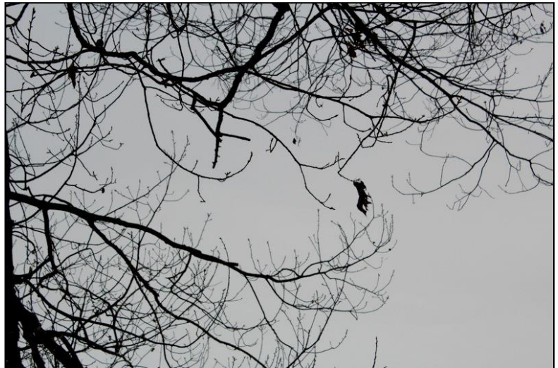
Not quite spring Mt. Hope- May 3, 2018