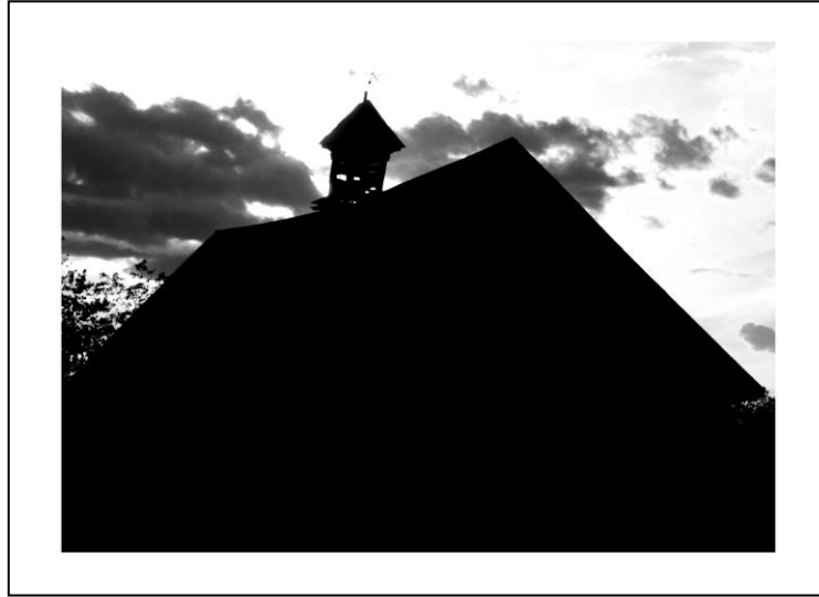
College Avenue, Orono, May 21, 2018