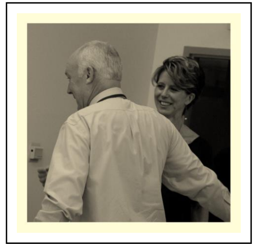
Coming and going