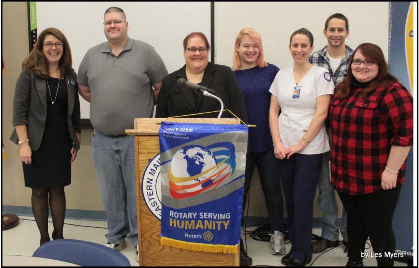
by Les Myers