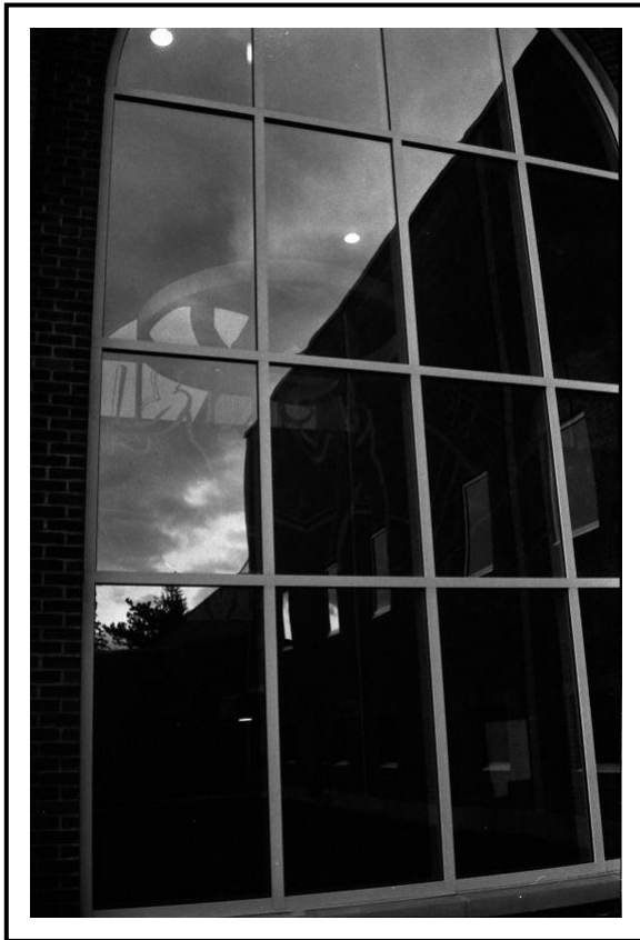
More panes- University of Maine